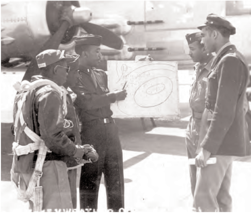
A weather briefing at the 477th Composite Group.

THE POST-WAR AIR WEATHER SERVICE FOR REASONS YET NOT DISCOVERED, STEPPED OUT AHEAD OF THE REST OF THE AIR FORCE AND PRESIDENT HARRY TRUMAN'S EXECUTIVE ORDER 9981