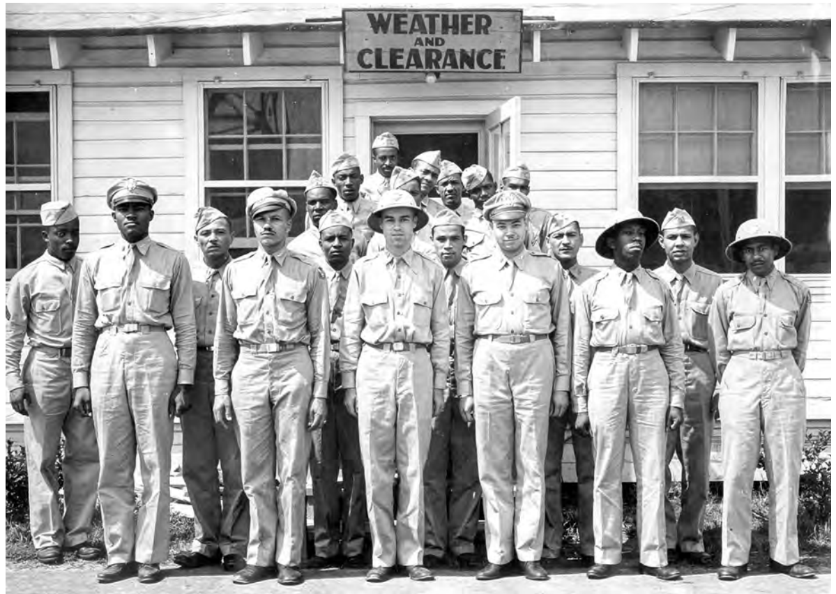
The staff of the Tuskegee weather station.